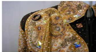
JEAN'S CUSTOM SHOW FASHIONS 336-341-8238 148 FASHION LANE MT Airy, NC 27030